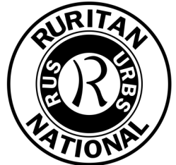
Redwood Ruritan Club Durham, NC