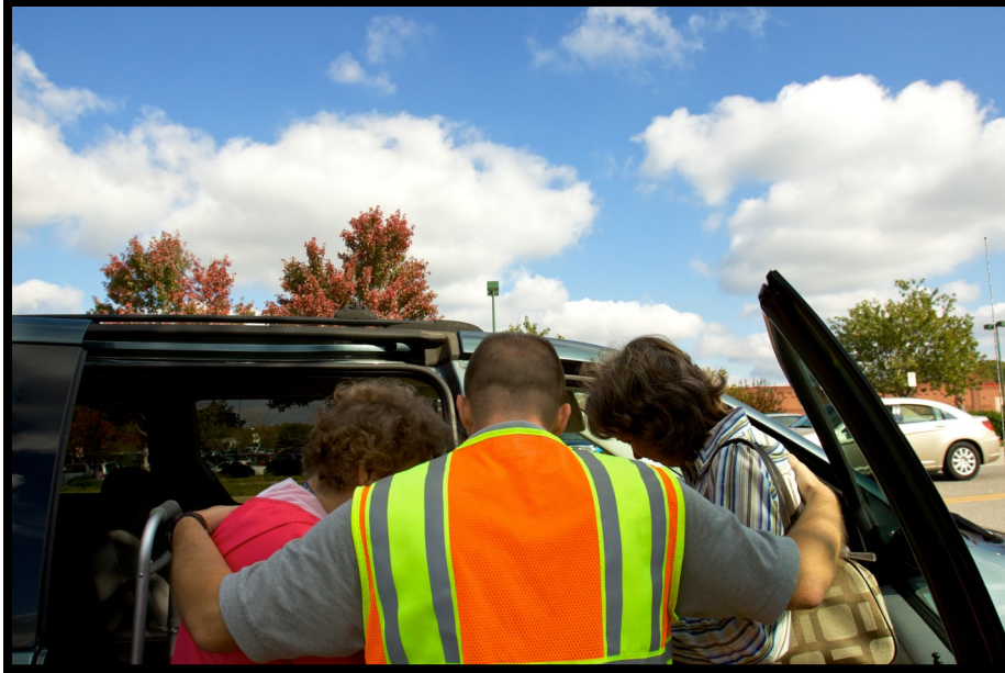
One of our chaplains praying with citizens at scene of a motor vehicle collision.